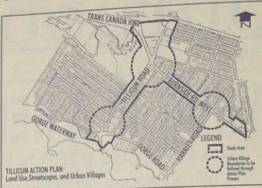
Community Action Plan Map indicating study areas and Urban Village boundaries.

Good architecture recognizes human scale and perspective. Today, there is a revival of the concept that people are the most important component of a community, where automobile traffic is less dominant, and other forms of transportation are given more consideration. Village centres are the hub of the community, and people walk and cycle more as they take back their neighbourhood. They even start talking to one another! With the Local Action Plan for Tillicum and Burnside Roads just started,