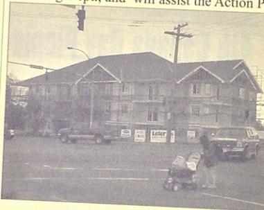
▲ Neighbourhood Housing Project nearing completion at the corner of Tillicum and Burnside Roads. (above) Concept Sketch of an Urban Village Plan illustrating better interaction between people and their community environment. (right) ▶

Action Plan. The Steering Committee conducted a walkabout of the study area on April 6th, 2002 to get a hands-on understanding of the situation. The next opportunity for public input will occur at a Community Open House prior to Summer, 2002.