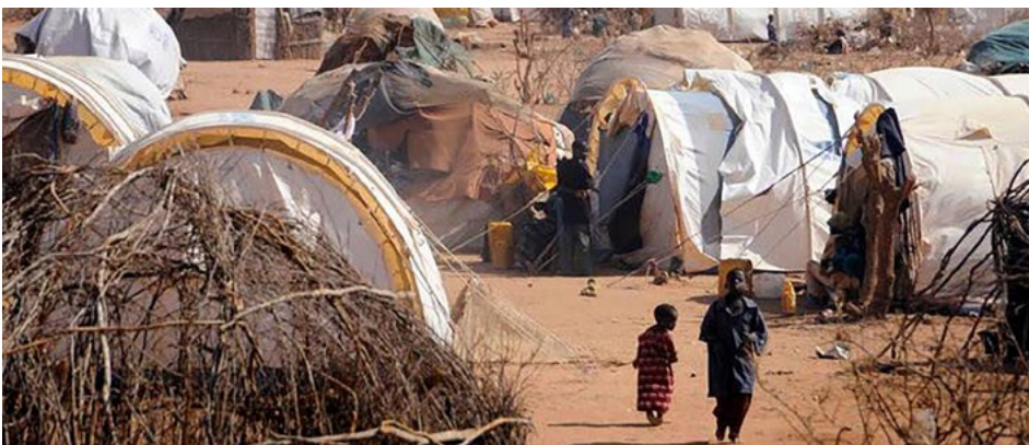
Typical refugee camp.