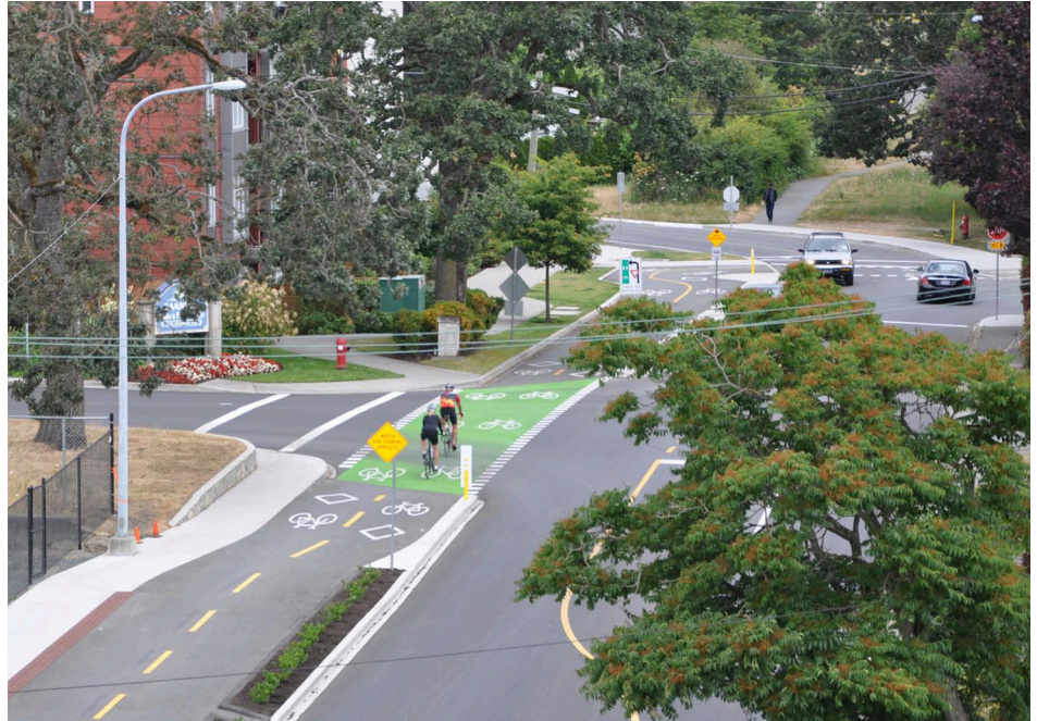
Picture of AAA cycling infrastructure from the Saanich Active Transportation Plan. Saanich is proposing similar bike lanes for the south (water) side of the Gorge Road between Tillicum and Admirals.

Saanich typically tries to tie in road work with underground work to save money so this is entirely consistent with past practice. Though the road work plan is still under discussion, the general idea is to create a protected two way bike lane on the south side of the road with 'floating' bus stops between the new bike lanes and the road. The project also includes a new side walk on the north side of the road.