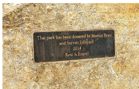
Plaque in Walter Park

to a beautiful natural area where people come to enjoy the space.