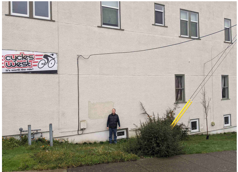
Paul Kimmitt pictured in front of the site of the future mural on the Wascana side of 100 Burnside Rd.W.

There are steps down to the cycle shop from Burnside Road, and interestingly, the building was originally street level,