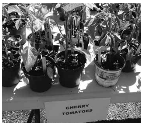
Sale items at the Annual Plant Sale

I hope you made it to our Plant Sale. This pleasantly chaotic event is a major annual fundraiser for the Gardens, and the proceeds help to pay for soil, wood, irrigation updates, and more. We've added a bottle drive this year which will — hint, hint — reappear at the Open House being planned for September. The plants for our sale are generously donated by members of the Gorge