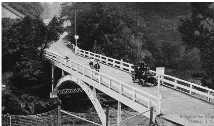
Fifth Gorge Bridge Circa 1920