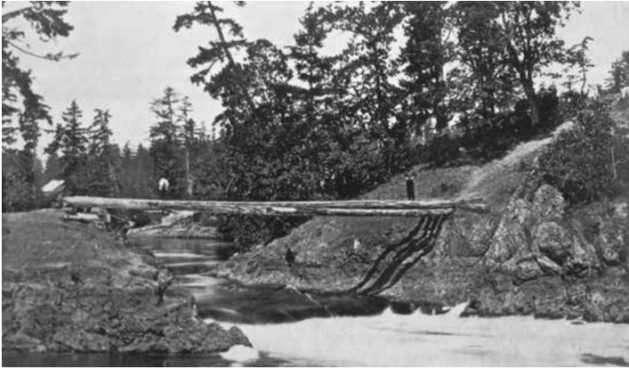
First Gorge Bridge, looking west, away from town. Circa 1866