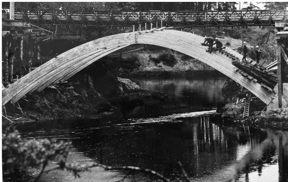
The 7th Gorge Bridge during construction, (with temporary single-lane 'bailey bridge' in behind,) circa 1966.

The 5th Gorge Bridge opened July 6, 1899 and lasted (albeit in very poor shape in its last decade) until the spring of 1933.