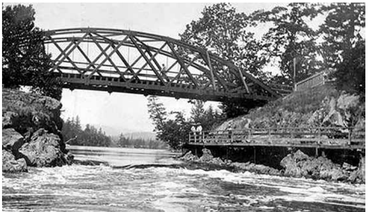
Fourth Gorge Bridge Circa 1890's