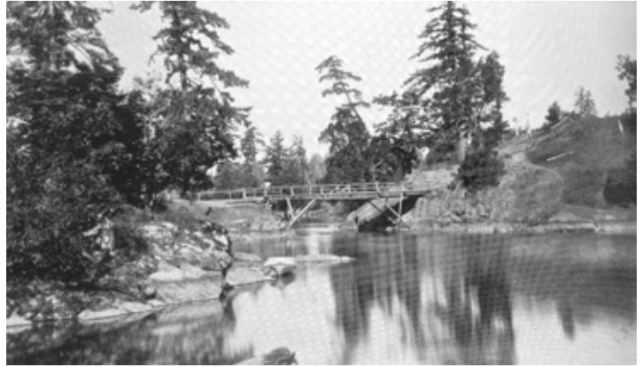
Second Gorge Bridge Circa 1870 - Photo by 'Maynard.' BC Archives G-04609