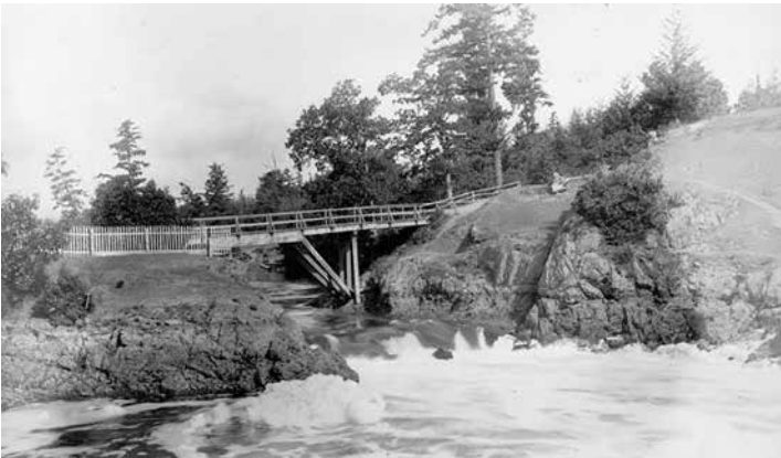
Third Gorge Bridge Circa 1872 - Credit: Library and Archives Canada/PA-023272