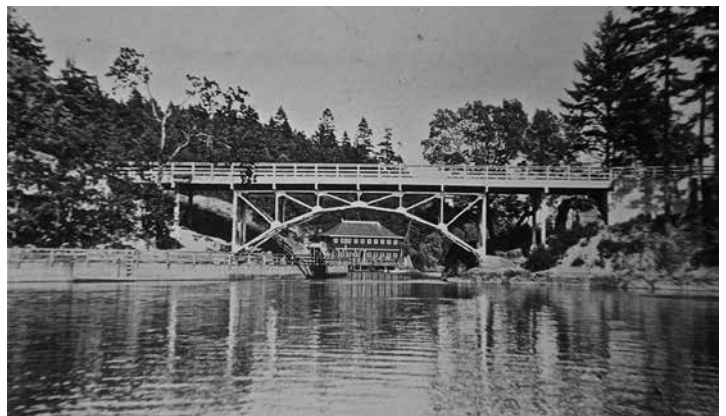
Sixth Gorge Bridge Circa 1940