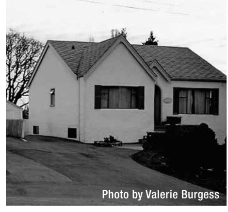
2921 Earl Grey as it looked in the late 1980's

After many meetings with the GTCA, between the landowners and directly affected neighbours, the properties on the corner of Gorge Rd and Earl Grey are now in the later stages of approval for redevelopment and soon, the home of Valerie's early childhood at 2921 Earl Grey, will be taken down